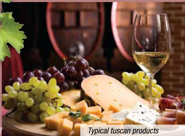
Typical tuscan products