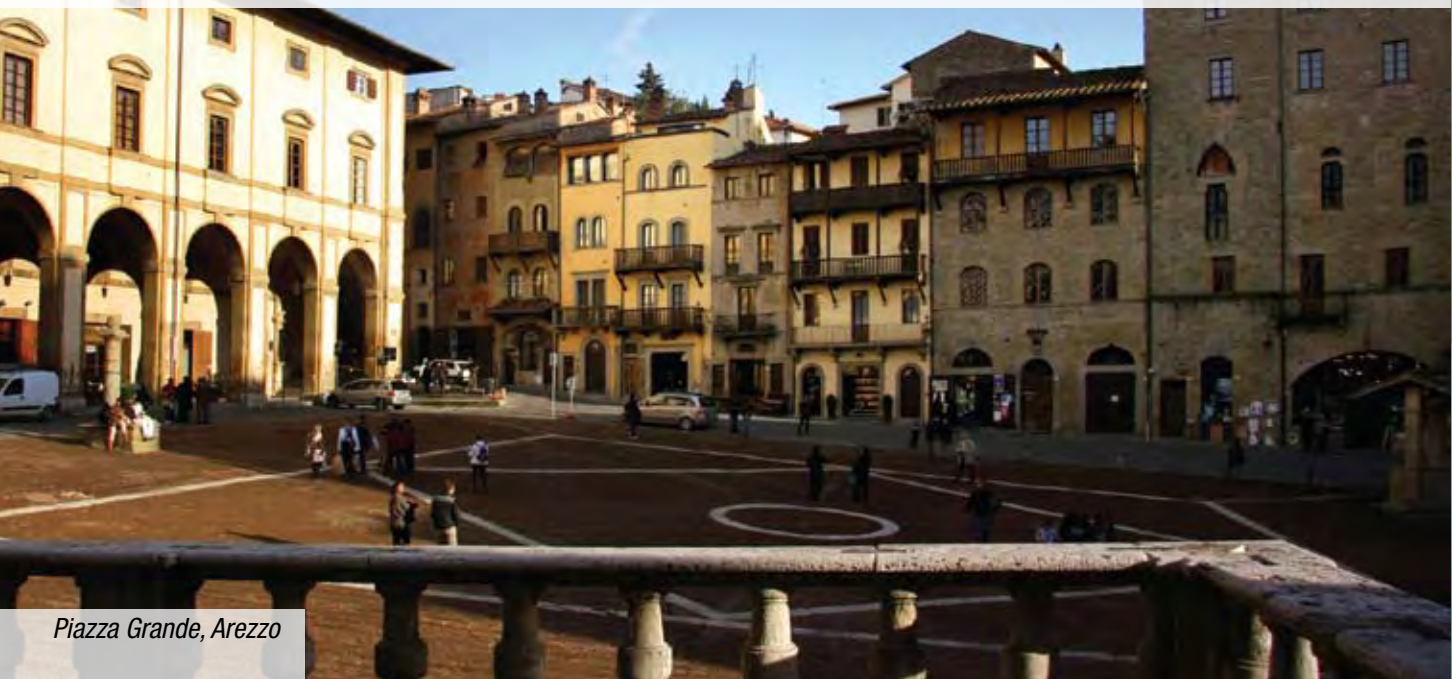
Piazza Grande, Arezzo

Thanks to many links you can easily reach others important cities such as Siena, Pisa and Lucca.