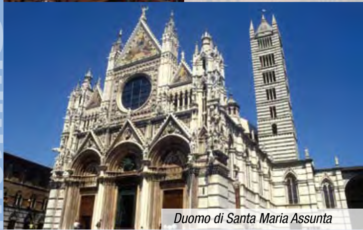
Duomo di Santa Maria Assunta