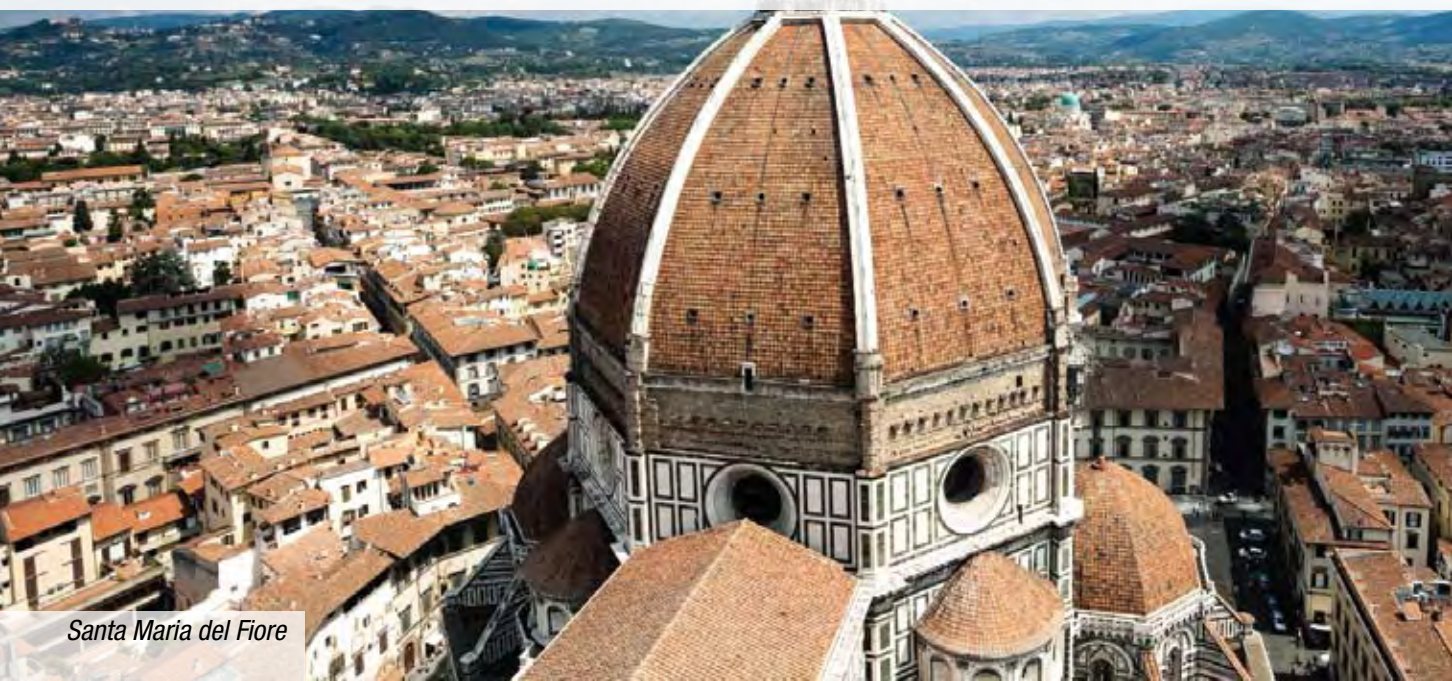
Santa Maria del Fiore

has been declared a World Heritage Site by UNESCO in 1982 and it gathers all the most meaningful cultural heritages of the entire city, as an example the Santa Maria del Fiore Cathedral (the domed cathedral of the city), Palazzo Vecchio (Old Palace) and Palazzo Pitti (Pitti Palace), Ponte Vecchio (Old bridge) and the Cappelle Medicee (Medici Chapels). Thanks to the artistic complex of the city together with the culinary tradition and the wonderful surrounding Florence is considered a world's incomparable destination.