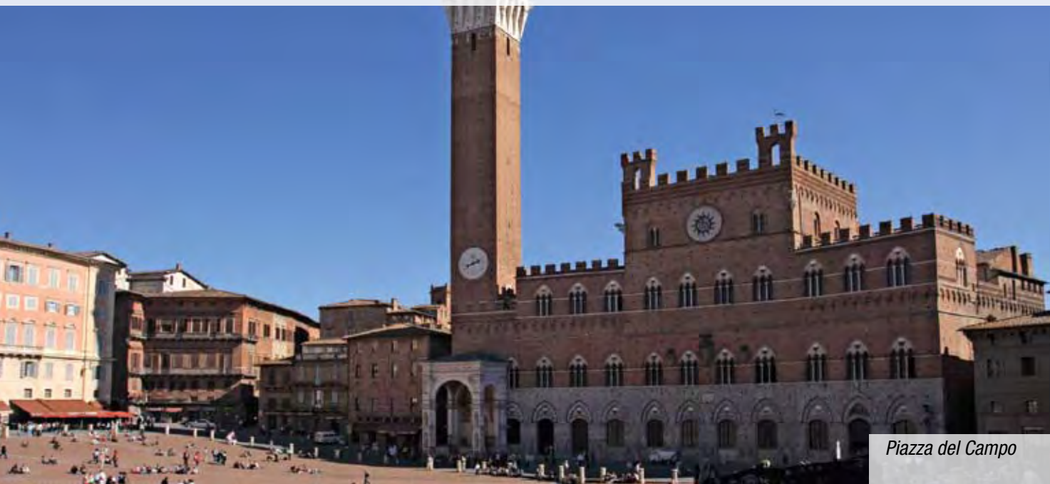
Piazza del Campo

The hole Siena's area is well-known also for the huge variety of great wines and for its gastronomic production.