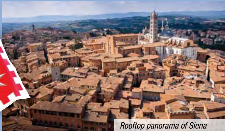
Rooftop panorama of Siena